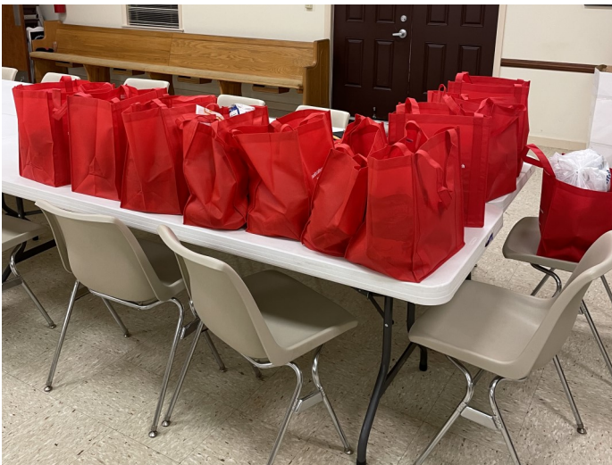
Mercy bags ready for delivery to We Care